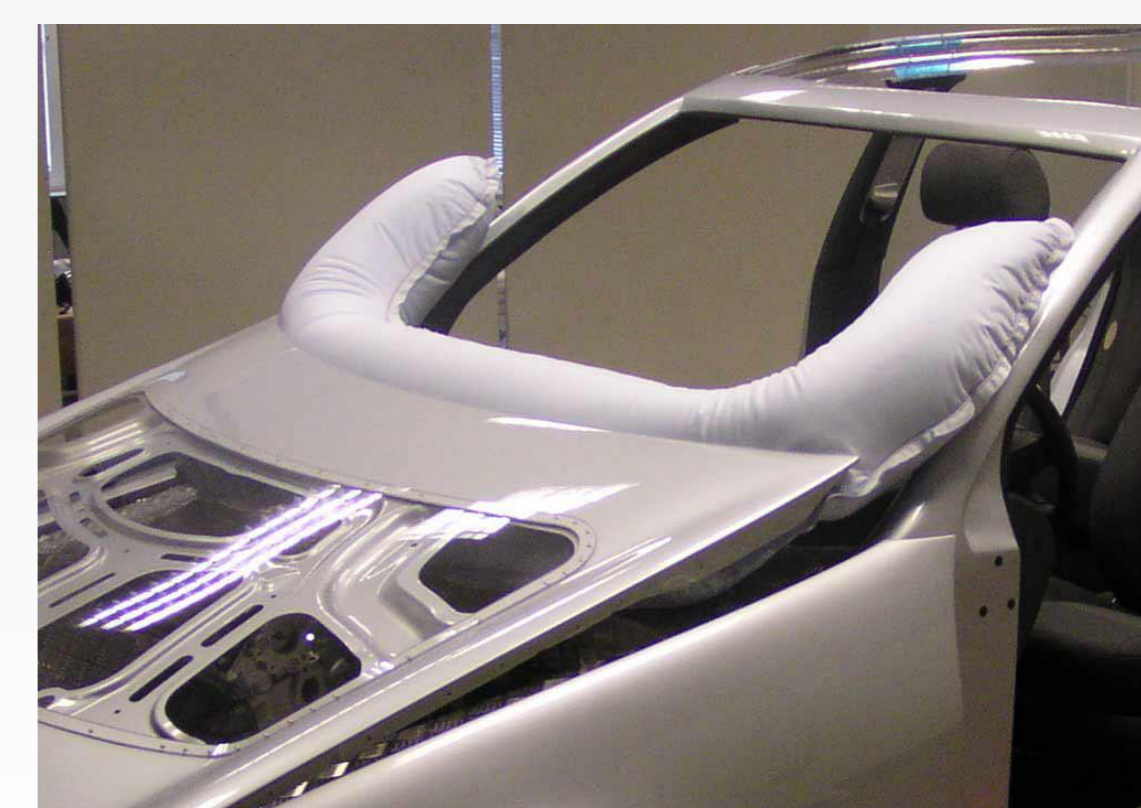
Example of A-pillar airbags combined with a pop-up bonnet

Impact countermeasures have been developed for passenger cars for many years, including pop-up bonnets and A-pillar airbags. However, because of the kinematics of pedestrian impacts with small city cars, it is likely that new countermeasures need to be developed, or existing ones altered, to provide the pedestrian with effective protection.